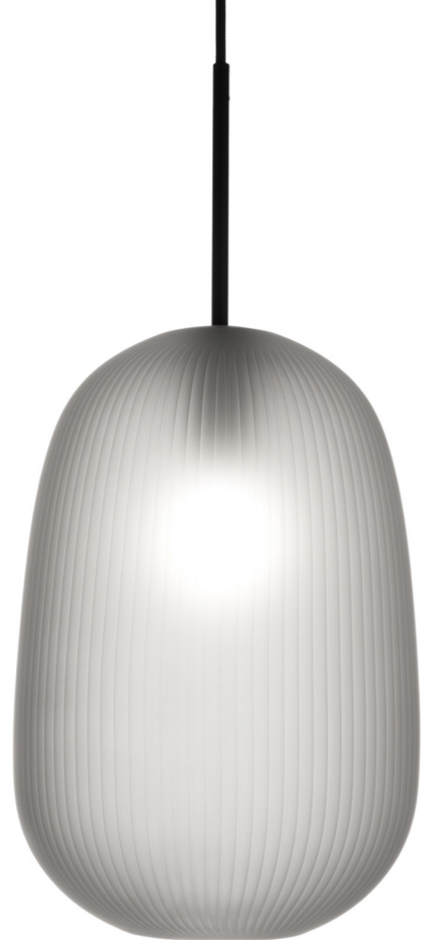
Version with E27 socket