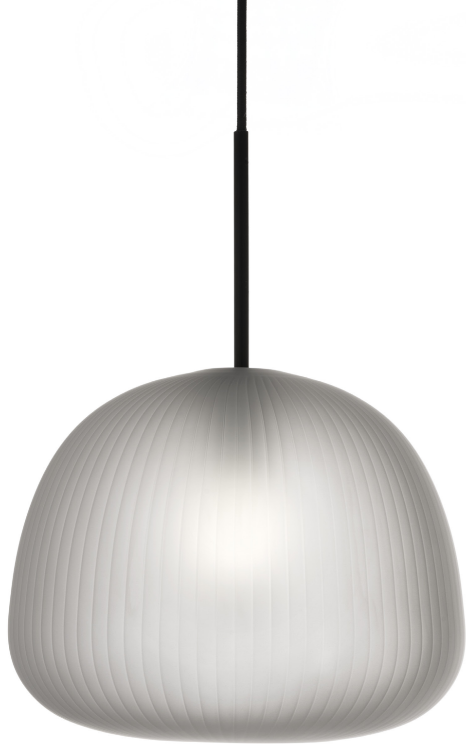
Version with E27 socket