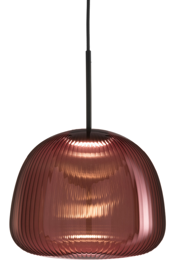
Version with LED module