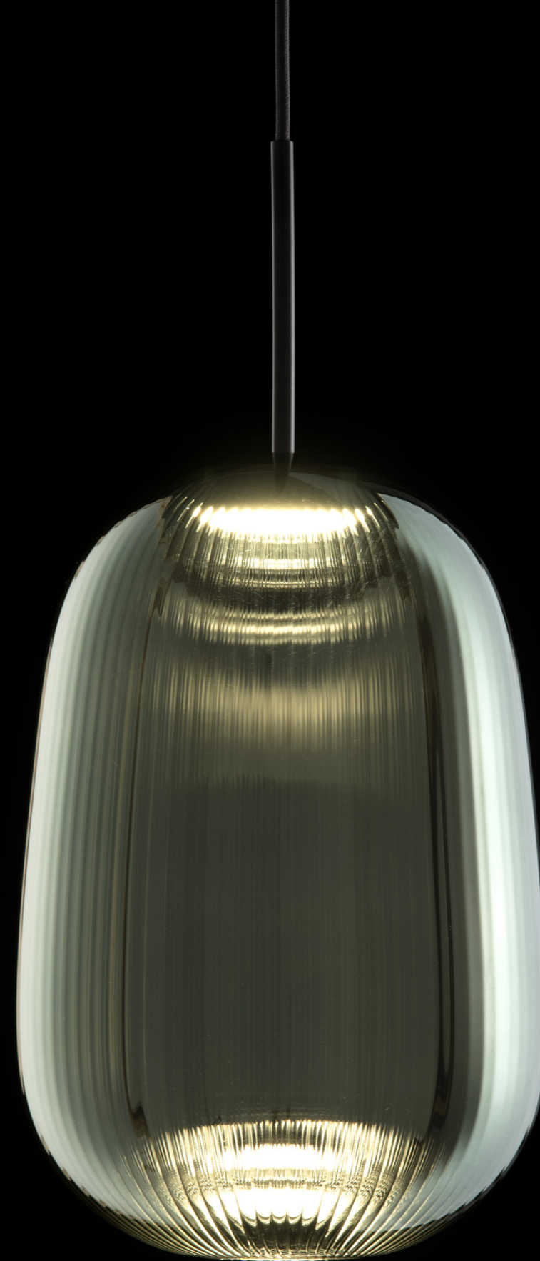
Version with LED module