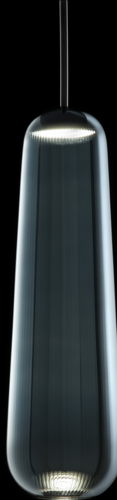
Version with LED module