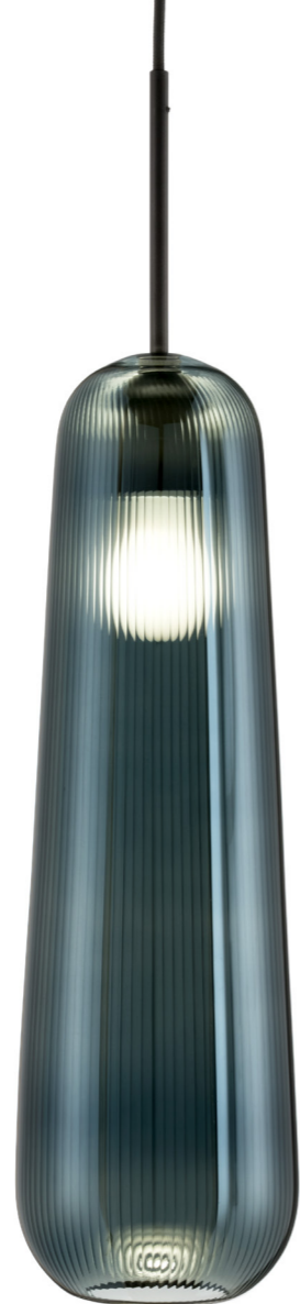
Version with E27 socket